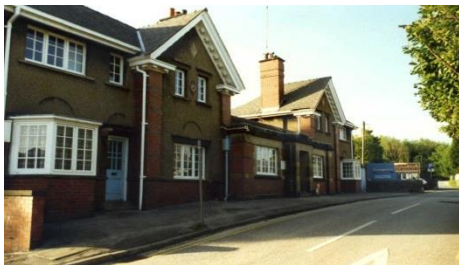
Grange Police Station. Pat Rowland, May 1996.

from above the ambulance station in Kents Bank Road. In 1994, SLDC, the owners of the site, drew up a brief for redevelopment and then put it on the market 'for retail, leisure or business uses (with housing content)' : a catch-all in other words to see what would come up. The site was described as a messy, neglected collection of buildings, yards, tips and rough parking areas, whilst it was regarded as perhaps the most valuable site to go onto the market in Grange for a long time. At that time the site contained a barn (still remaining) and attached probably the old abattoir belonging to Asplin's butchers, Compton's showroom and workshop, and the Grange Police Station (relocated to Victoria Hall) and a building which was formerly the